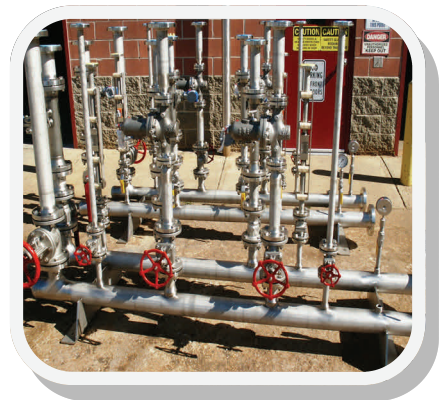
Completed manifolds undergoing hydrostatic pressure test.